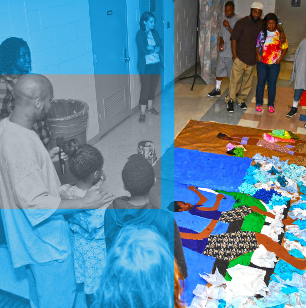
A Program of Hope, FCI Cumberland