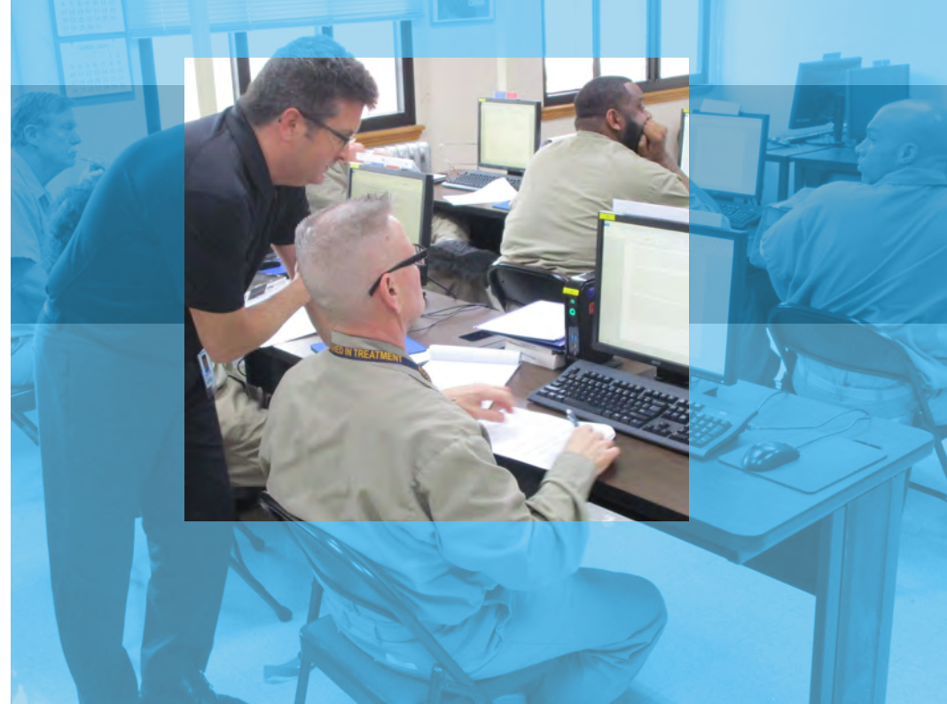
Writing Transforms Lives, Federal Prison Camp, Yankton, SD

Writer-in-Residence is part of the Artist-in-Residence (AIR) program that provides inmates with exposure to professional artists. AIR is funded by the National Endowment for the Arts, and is currently running at six BOP institutions.